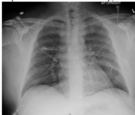
Figure 1. Chest X-ray showing bilateral ground-glass opacities.

Workup was performed and chest x-ray showed diffuse bilateral pulmonary infiltrates (Figure 1), hence, the patient was started on empiric antibiotic and steroid therapy.