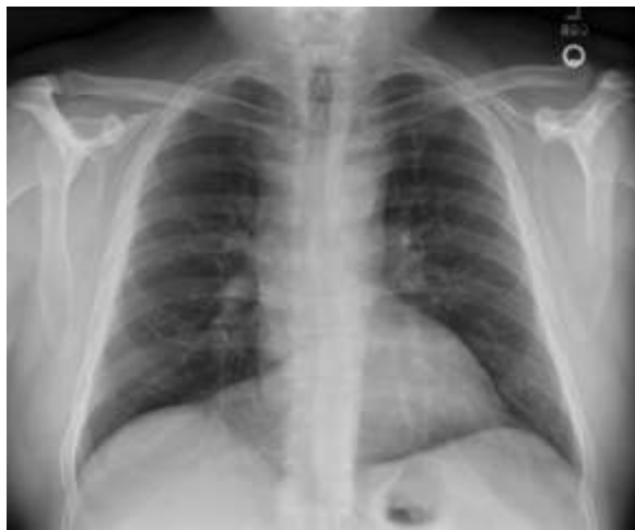
Figure 4. Chest x-ray upon follow-up.

Supplemental oxygen was eventually weaned off to room air. There wasn't significant desaturation observed with the exercise trial. He was discharged home on a gradually tapering dose of oral steroids over 6 weeks. The patient was later seen at the pulmonary clinic for a follow-up visit. He was doing well and denied any significant respiratory symptoms. A follow-up chest x-ray was within normal limits (Figure 4).