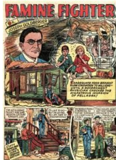
Figure 2. Joseph Goldberger in "Real Life Comics".

Goldberger died in 1929 of renal cell carcinoma not having convinced public health officials of a dietary cause of pellagra. Goldberger should be remembered not only for his superb investigations but for formulating a hypothesis, testing it and not surrendering to insults of his heritage or religion. Although rarely remembered in medical textbooks, he has been immortalized in some unlikely places including "Real Life Comics" in 1941 (Figure 2). In some aspects Goldberger's story is echoed in modern day politics where politicians attempt to manipulate or deny scientific discovery to further their own political careers. Even when Goldberger showed that affordable therapy with yeast cured pellagra, many Southern politicians remained reticent to accept diet as a cause of the disease. Their ambitions undoubtedly contributed to the excess mortality and morbidity of thousands of impoverished Southerners in the early twentieth century.